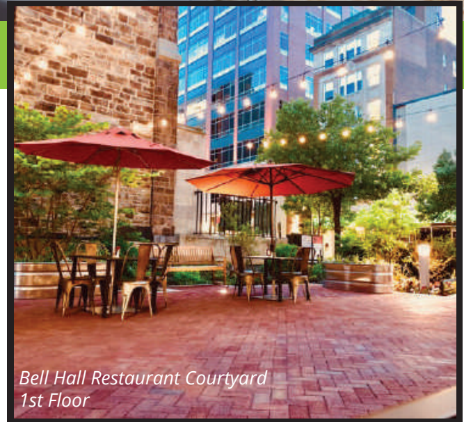
Bell Hall Restaurant Courtyard 1st Floor

LARRY DUGAN 610.332.7320, EXT 2 LDUGAN@EMERALDREALTYGROUP.COM